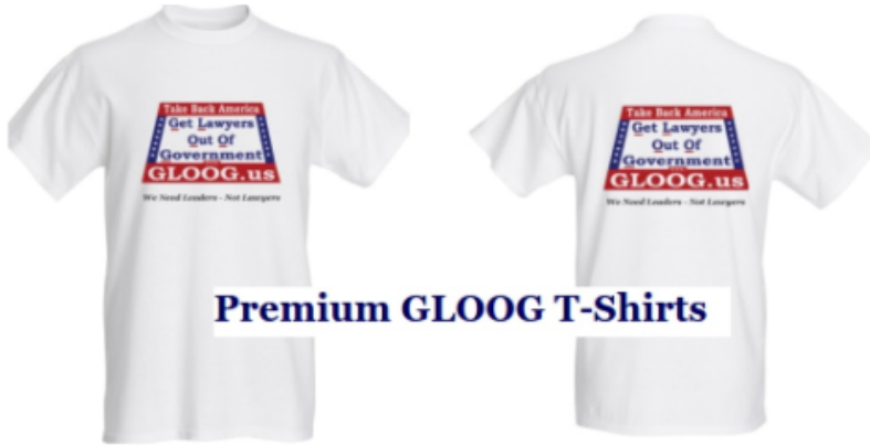
Premium GLOOG T-Shirts