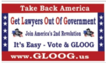
Premium GLOOG Cards